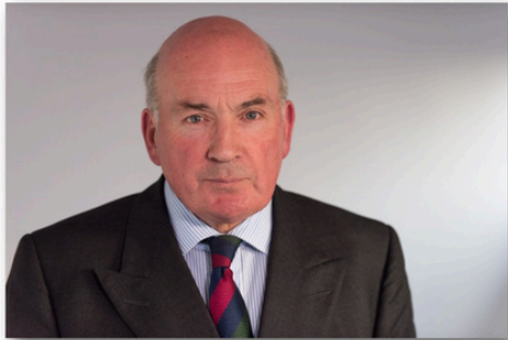
General The Lord Dannatt GCB CBE MC DL

I am delighted to have been invited to be a Patron of the Sheringham Museum. I have enjoyed many summer holidays in Sheringham, often as part of the Scripture Union Beach Mission team, and the first house I owned was in Sheringham! I have just retired from being Chairman of the Royal Armouries, our national museum of arms, armour and firearms, so I am very happy now to be associated with a different museum in a town where I have many happy memories.