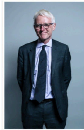
Sir Norman Lamb

I was the local MP for North Norfolk 2001-2019. I am delighted to have been asked to become a Patron and I am very pleased to accept because I have an enormous admiration for the work of everyone involved in the museum. This is a very valuable gem that Sheringham is very proud of.